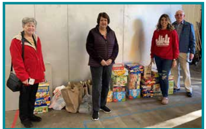
Delivering donations to City Lights Ministry - The Gathering Sunday Bible Study class and Global Women mission group.