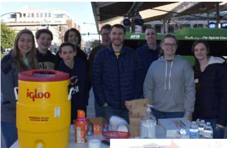
Youth ministry team at the downtown bus terminal

You have now heard of Growing Young and the team that will be working on this initiative for the next year. Maybe it's the first time you have heard of this initiative or maybe you have heard of it before. Wherever you are, we would like to invite you into the conversation through getting a copy of the book. You might not be sure what this is all about, you may be cautious, you may be optimistic, or you might not know what to think...all approaches are alright. We would like for those who are interested to let the church office know that you would like a copy of the book. We can get a great deal by purchasing in bulk and will ask that everyone pay a small fee of $10 to help defray the cost. We look forward to hearing back from you as you read through the book, form questions you might have, spark ideas from something you read, and more.